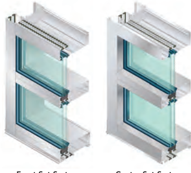
Front Set System Center Set System

The Trifab® 601/601T/601UT Framing System is designed with cost and flexibility in mind. With a 2" x 6" frame profile, the sightline is consistent with current framing systems and the glass pockets are aligned to 4-1/2"-deep Trifab® framing systems. This allows for a shallow horizontal member that not only lowers overall metal costs, but also provides